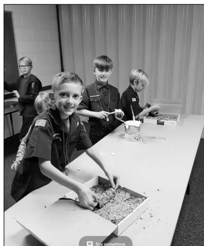
(Above) At the Cub Scout Pack Meeting in March, the boys, leaders and family members made awesome bird whistles and bird feeders.