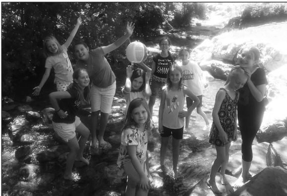
Activity Day girls and leaders had fun playing in the water at Creekside Park on June 13.

Wednesday, August 22 at 1:30 p.m. - Meet at the church for a hike. Bring water, a hat and comfortable walking shoes!!!