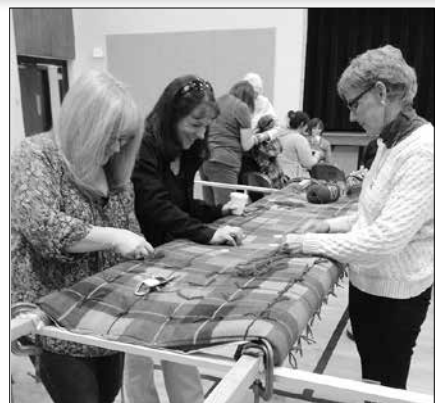
Two twin-sized quilts, about 16 fleece blankets and over 50 Snack Packs were donated to a homeless hospice facility in Salt Lake City. Special thanks to Sister Tommy Stuart for donating all the fleece blankets.