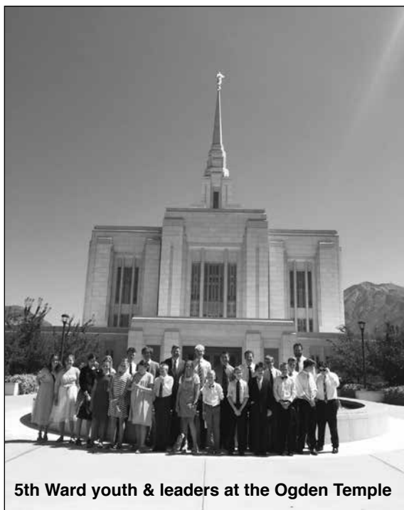
5th Ward youth & leaders at the Ogden Temple