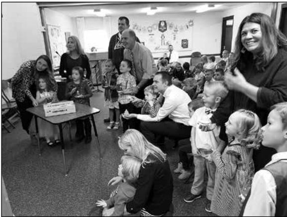
In October, the Primary children and their teachers got to play the bells while they began practicing the Christmas song they will be performing in December.