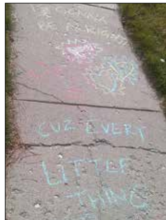
'Cuz every little thing Is gonna be alright!