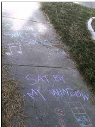
Sat by my window Singin' a sweet song ...