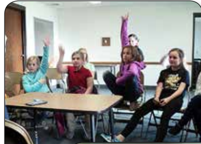
Activity Days in February