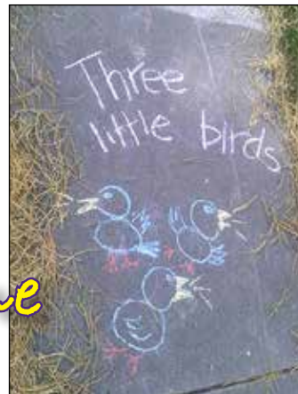
Three little birds ...