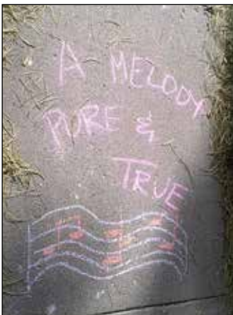
A melody pure and true ...