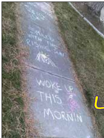
Woke up this mornin' Smiled with the rising sun ...