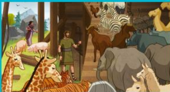
OLD TESTAMENT STORIES

New Resources for Home-centered Gospel Learning