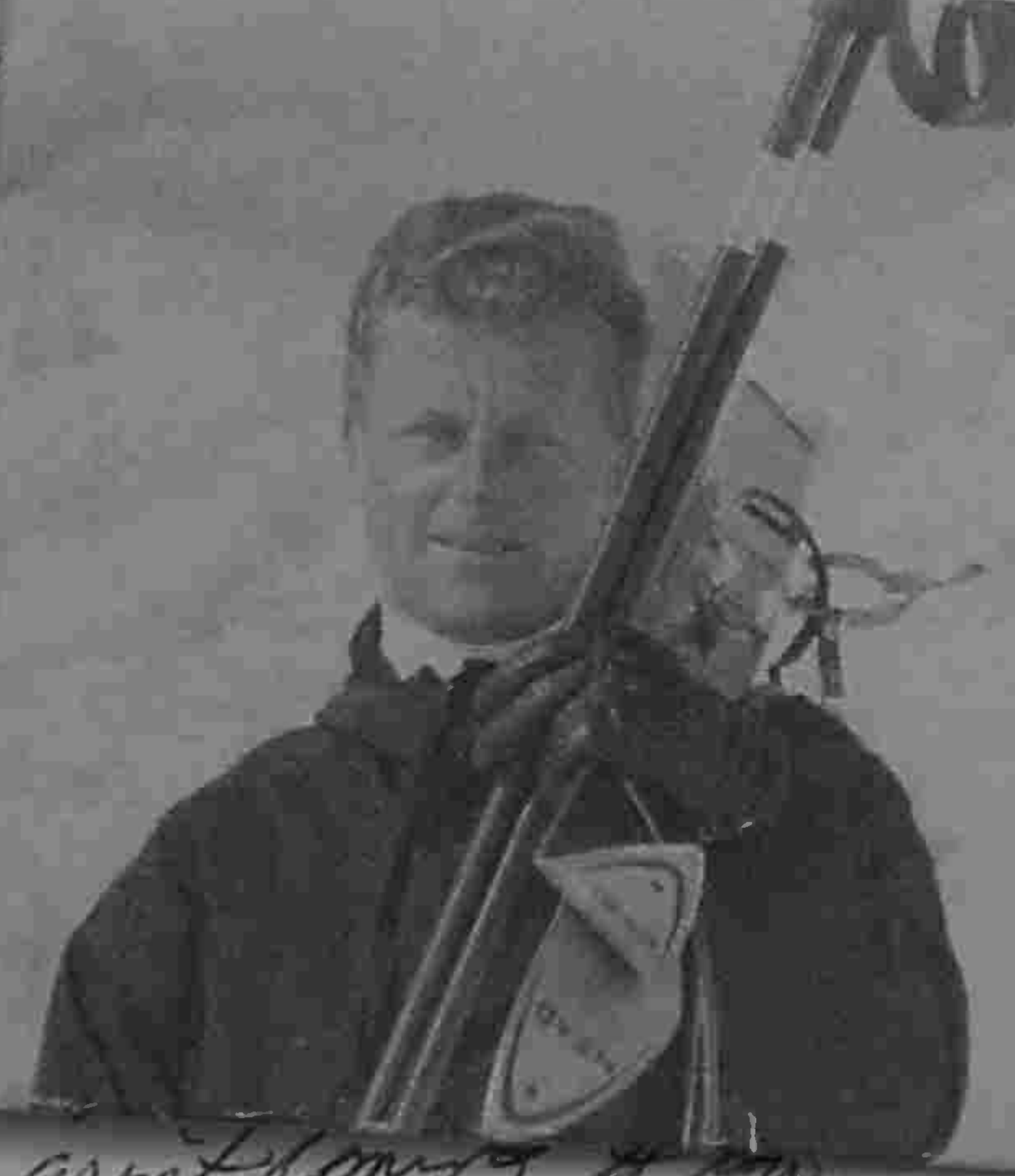
STEIN ERIKSEN LODGE