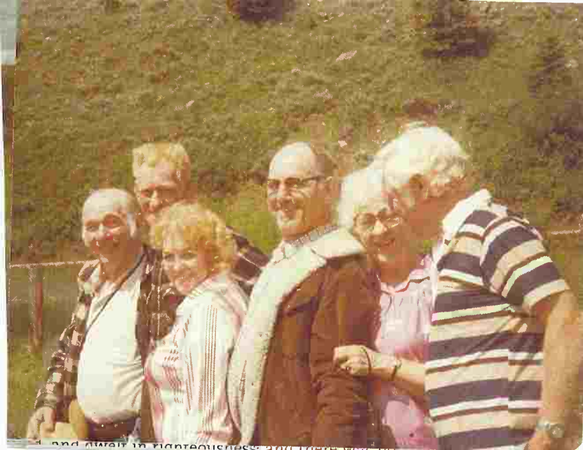
and dwell in righteousness: 20/10/10