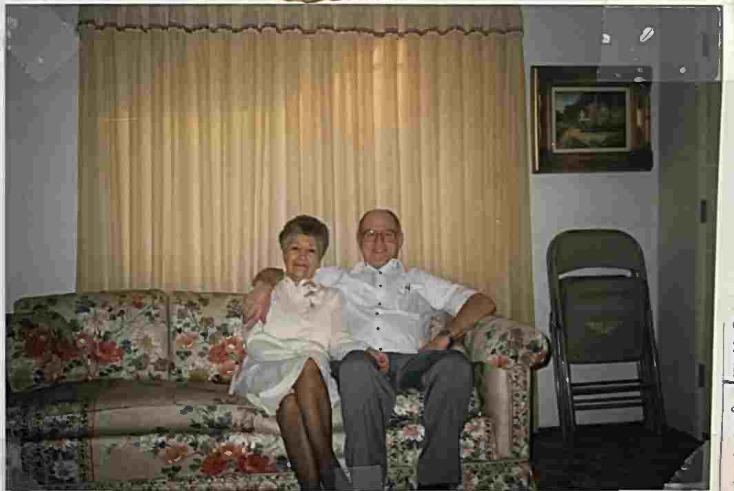
SUNDAY JAN-15-1989 MISSION FAREWELL