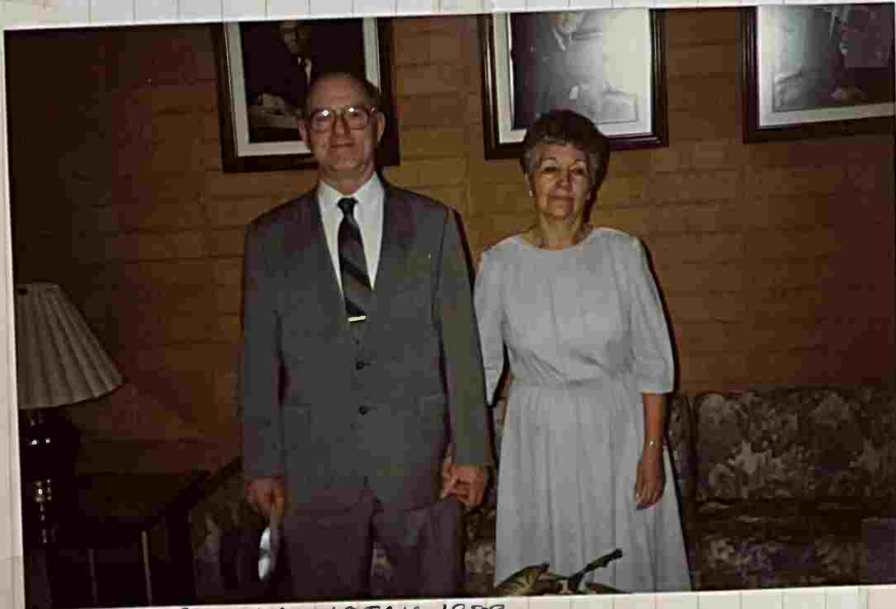
MTC, Provo, UT. 18 JAN. 1989