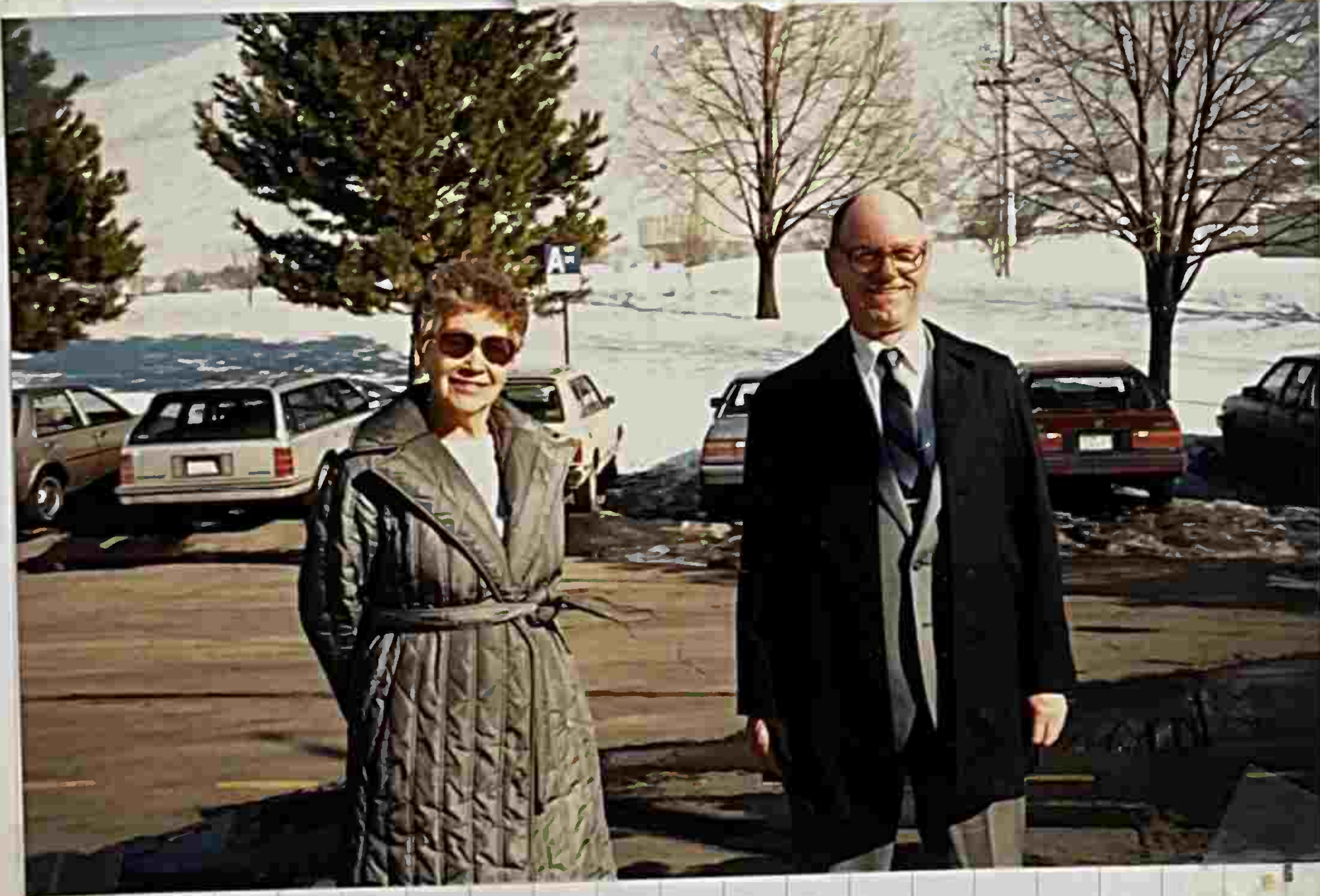
MTC PROVO, UTAH. JAN-18-1989